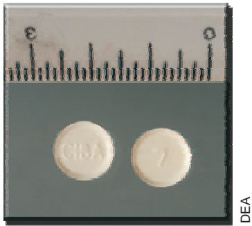
Ritalin 5 mg.